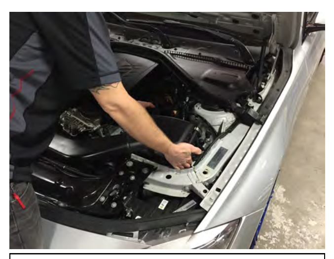
d. Gripping the airbox on both sides as shown, lift the factory intake plumbing out of its two mount sockets. The entire system can now be removed.

b. Disconnect MAF sensor wiring harness. Remove the sensor with a T20 Torx bit and set aside in a safe, clean place. Keep the screws for re-use.